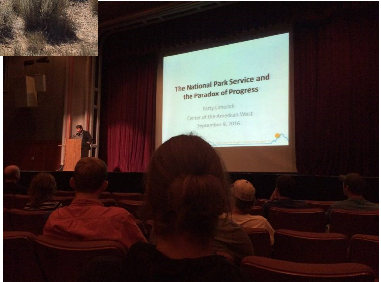
from the 27th Headwaters Conference last weekend.