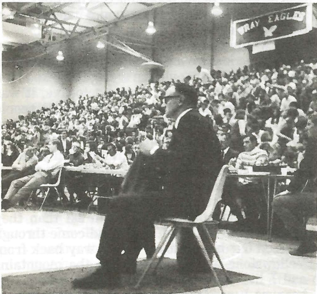
"I remember them all."